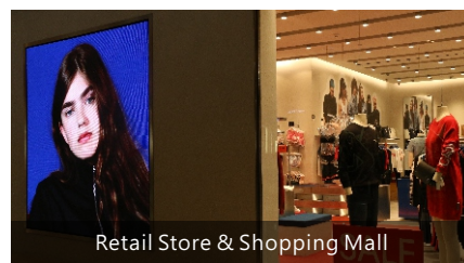
Retail Store & Shopping Mall