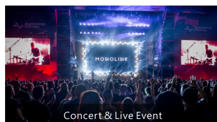
Concert & Live Event