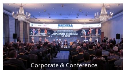
Corporate & Conference